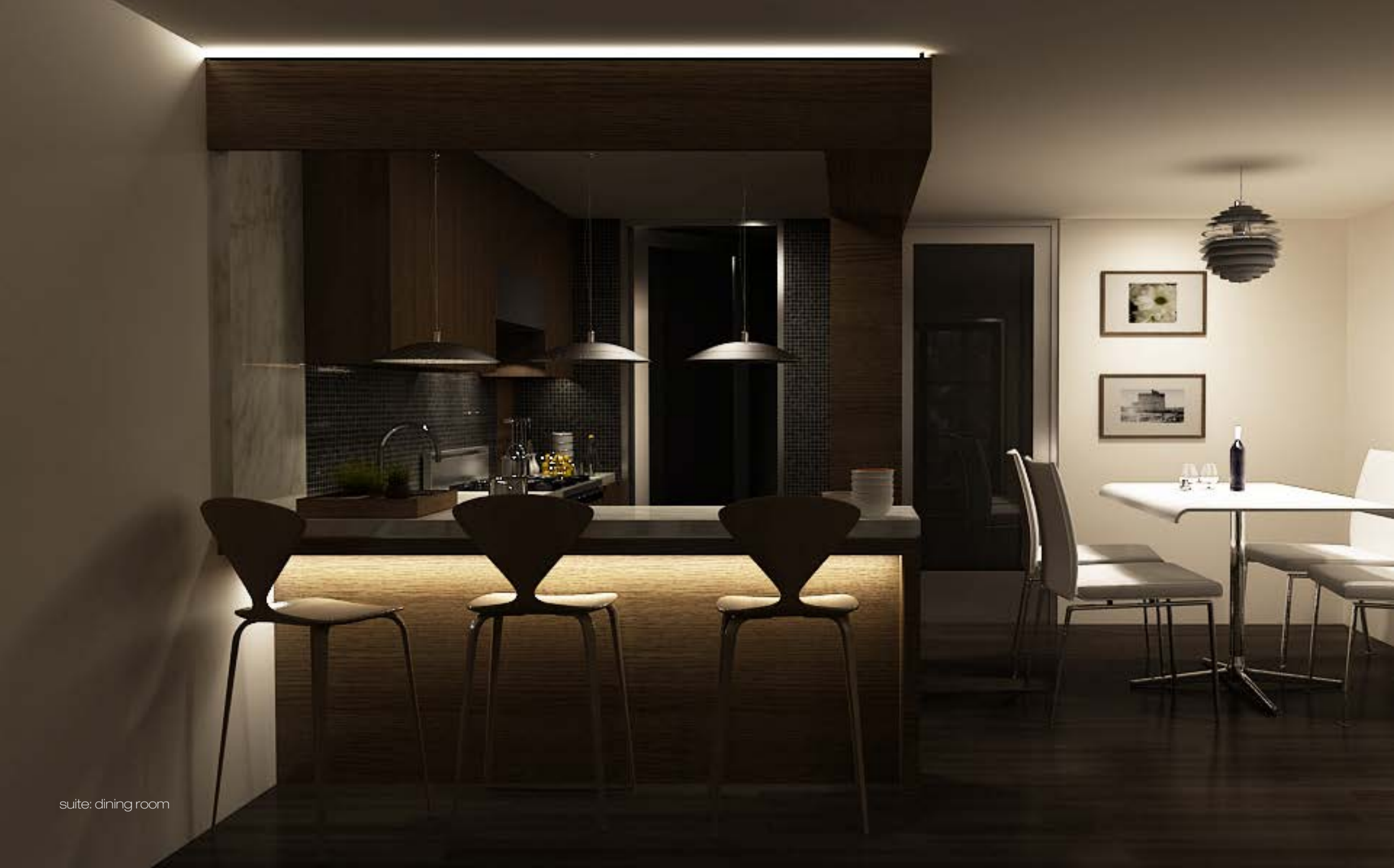
suite: dining room