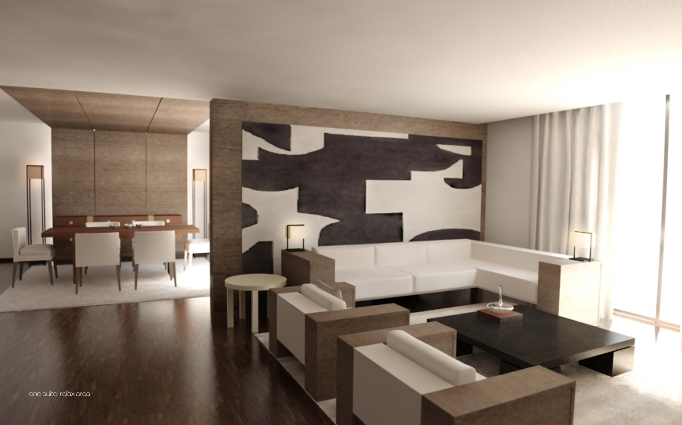
one suite: relax area