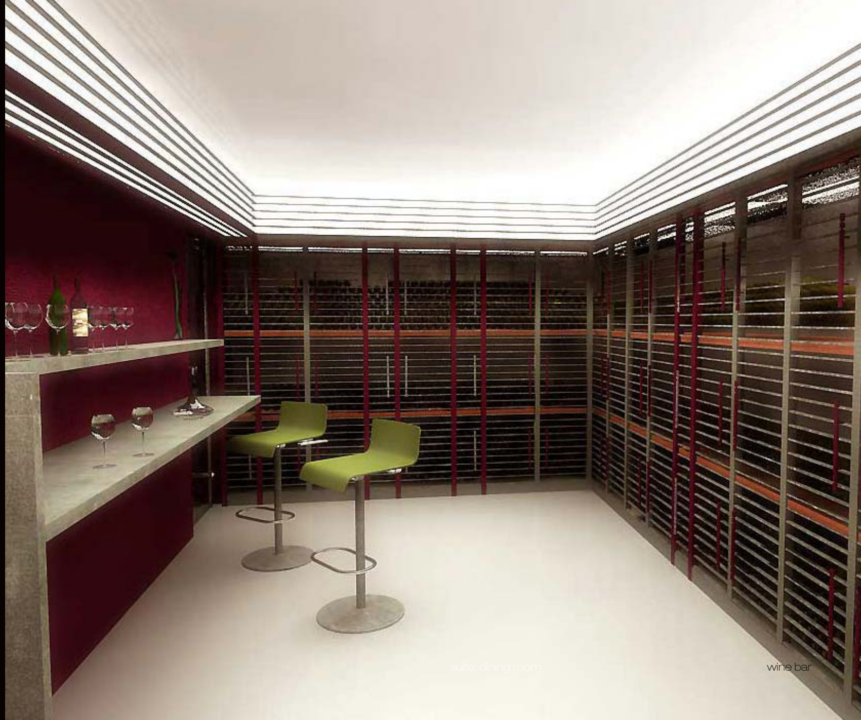
suite dining room