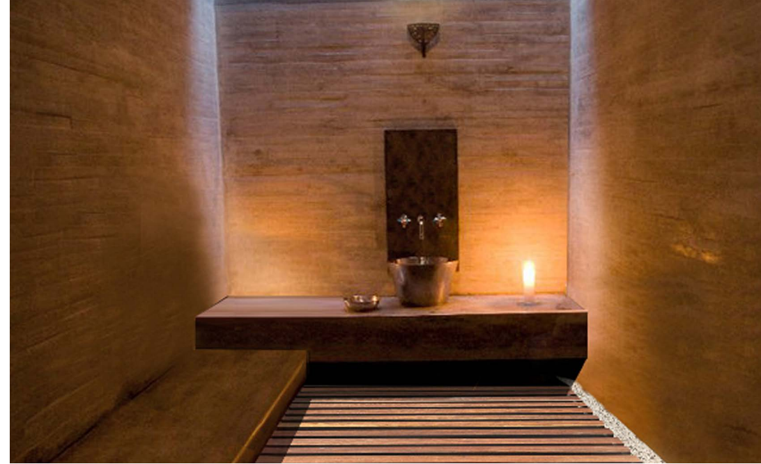
rooms'style - the spa