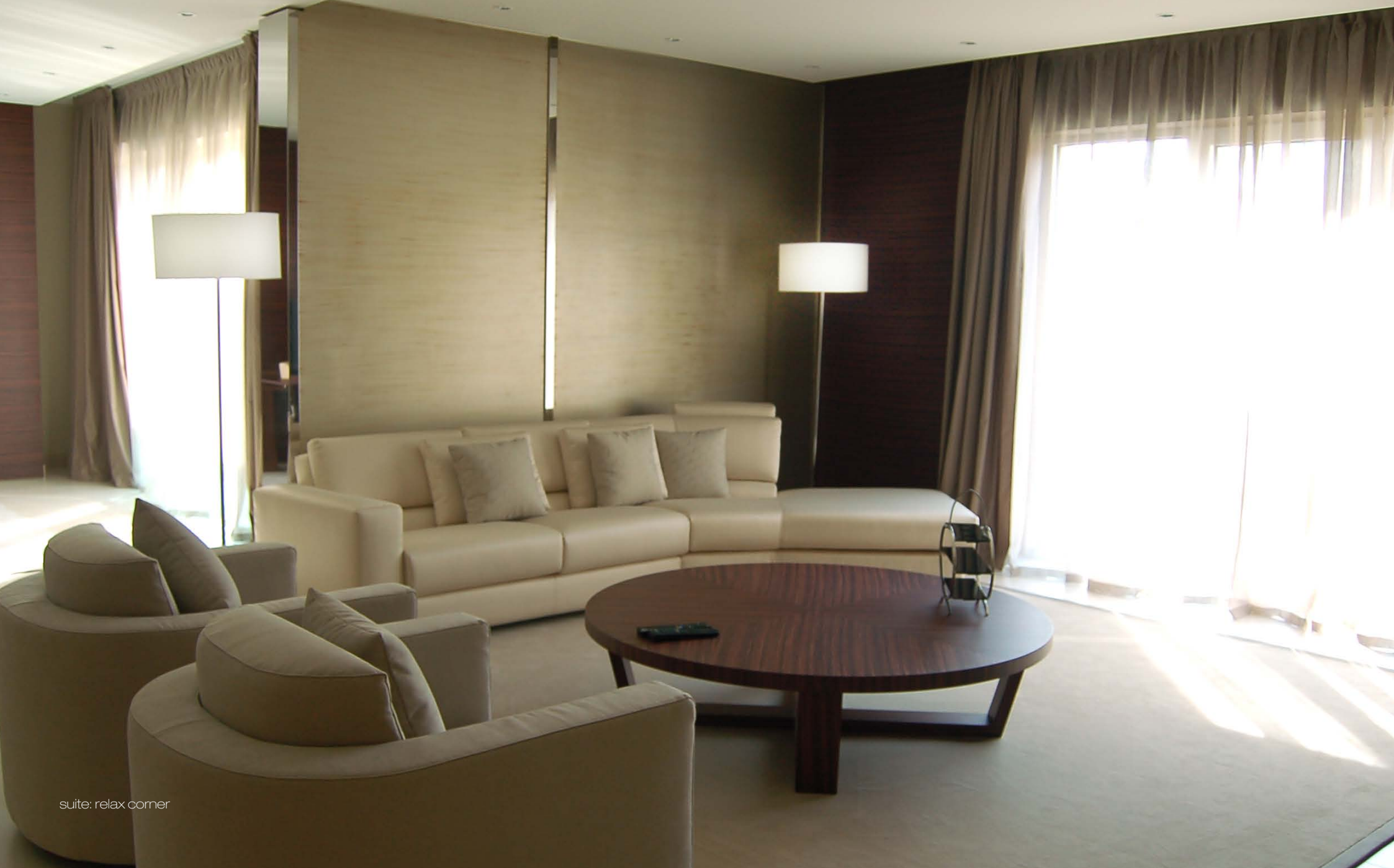
suite: relax corner