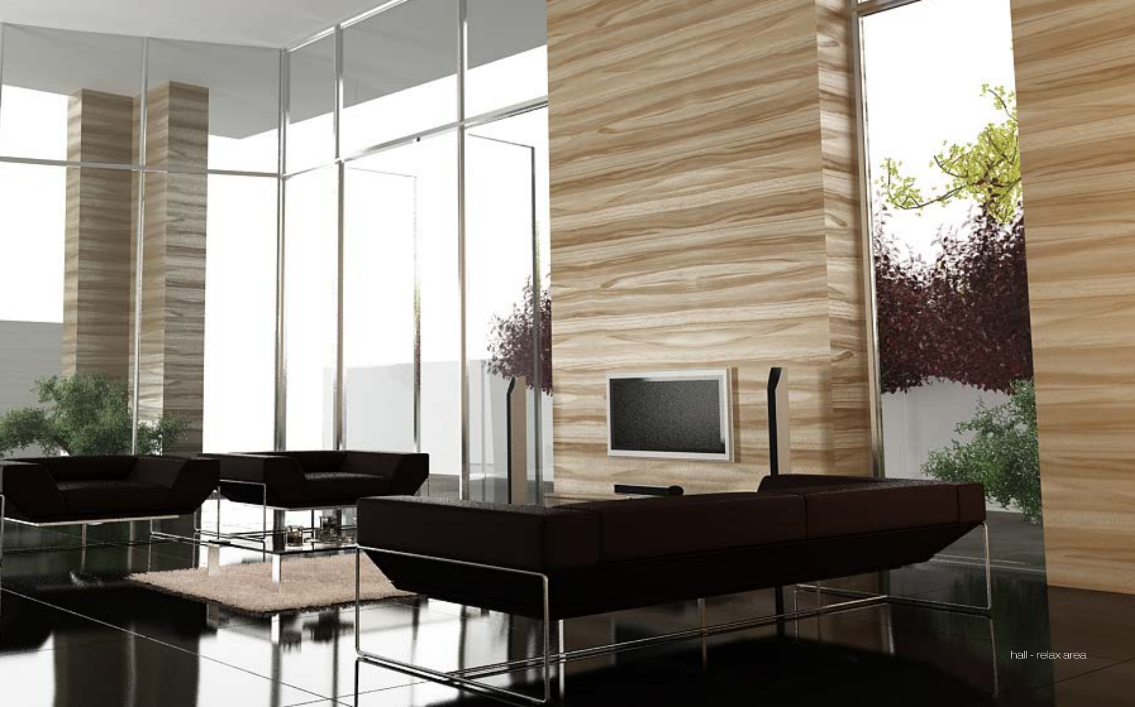
hall - relax area