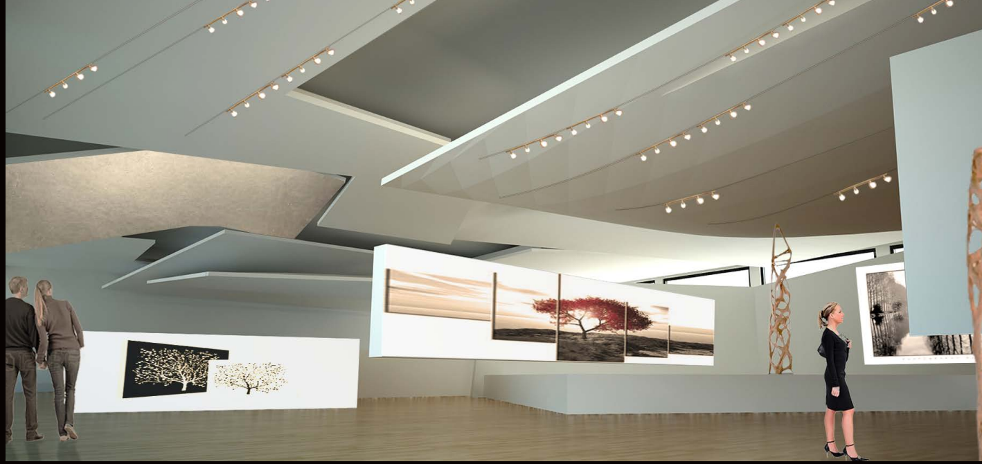
left, top: exhibition area - down: wine bar

The top floor has a luxurious restaurant with a turning terrace that offers a 360° view.