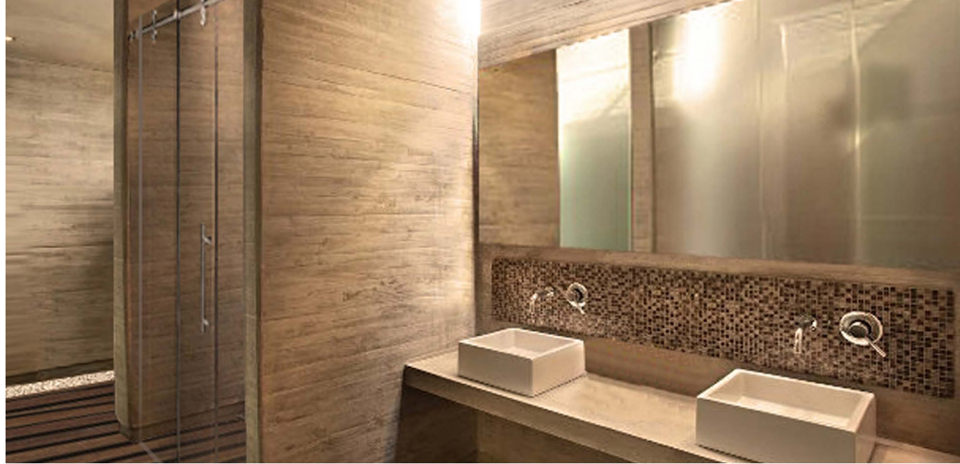
top: one bathroom - down: one bedroom

Project for one business and directional hotel, being a central part in a wider project of the new master-plan of the city and surrounding areas.